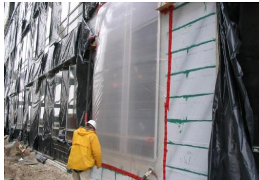
Smoke Tracer, ASTM E186