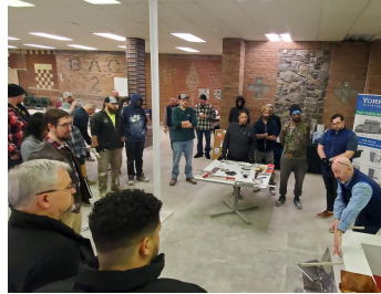
Mockup used for hands-on training with York 304 SA stainless steel flashing