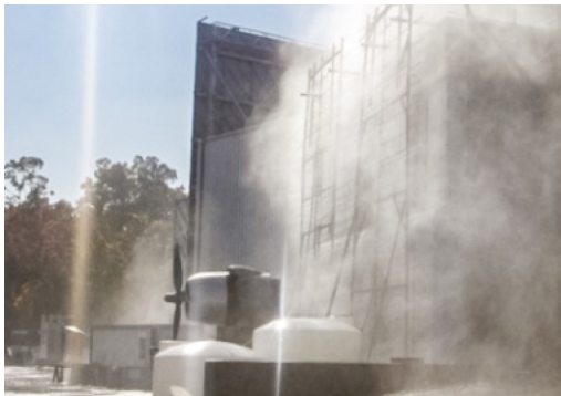
Laboratory Performance Mock-up Testing AAMA 501.1