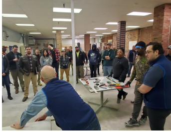
The educational event was held at the International Masonry Institute in Albany, NY