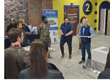
Seminar included a hands-on training and practice on flashing transitions